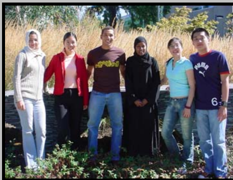
The MC student leaders pose after the Fall 2005 leadership training.

Peer tutoring supports student success and helps build confidence both in and out of the classroom.